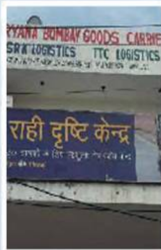
Raahi (Vision Centre in Faridabad in Collaboration with Sight Savers)