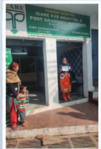
Shikarpur Vision Centre