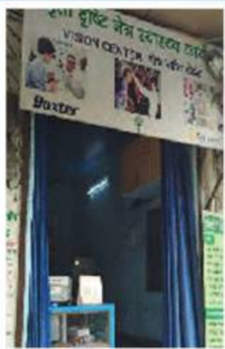
Vision Centre in Tahirpur, Delhi in Collaboration with Sight Savers